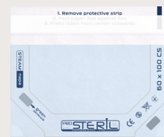
Combi Steam (CS)