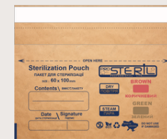
Premium Kraft Brown (PKB)