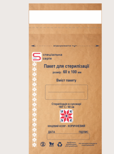
Special Edition (SE)