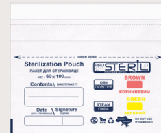
Premium Kraft White (PKW)