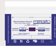
Combi Premium White (CPW)